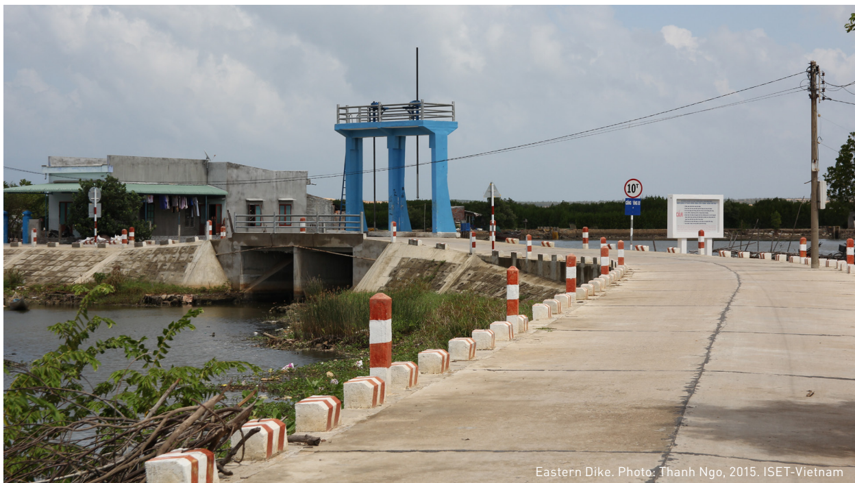
Eastern Dike.

plans for the area featuring particular development and investment projects. All of this activity was oriented to addressing flood risk and urban development planning in the floodplain of the Ha Thanh and Kon rivers.