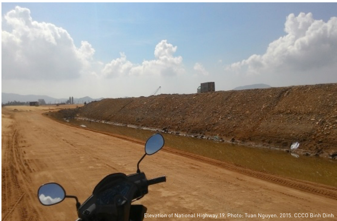
Elevation of National Highway 19.

Another problem is that different technical agencies and plans have different, and often inconsistent policy objectives. For example, while DARD and DoNRE support plans to restore mangroves in Thi Nai Lagoon to protect the lagoon shore, the aquatic environment and livelihoods, DoC approves plans to fill some parts of the lagoon to build new urban zones. These strategies are contradictory: it is difficult to destroy lagoon ecosystems and restore them at the same time. Another example is the development of a drainage plan that proposes to use Phu Hoa Lake as a flood retention lake, capable of receiving runoff and drainage from the surrounding area. But this is inconsistent with a recently approved lakefront residential development, because the lake level would have to fluctuate significantly to provide meaningful flood retention.