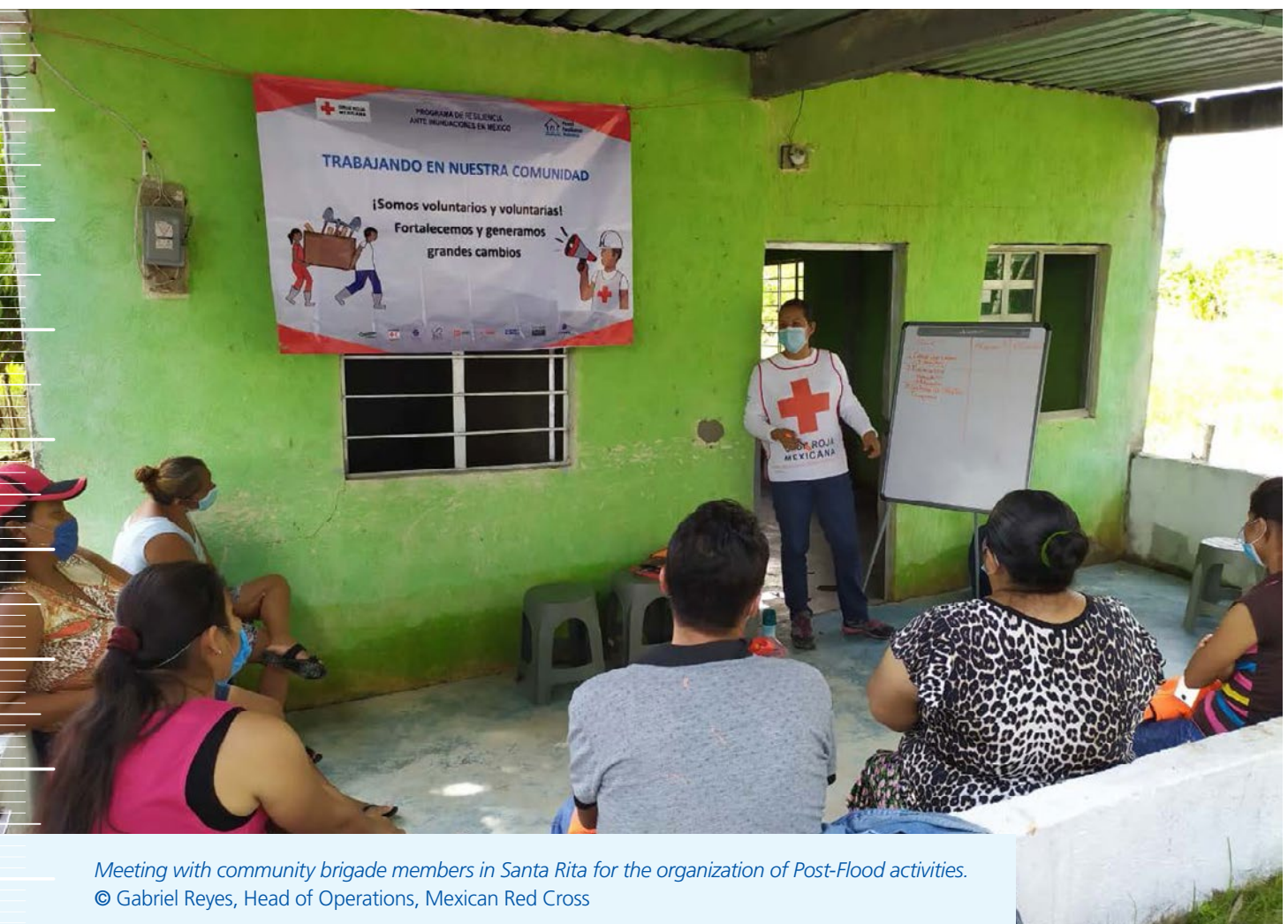
Meeting with community brigade members in Santa Rita for the organization of Post-Flood activities.

As the Alliance Phase I work drew to a close in 2017, the Mexican Red Cross shifted its focus toward ensuring the sustainability of the