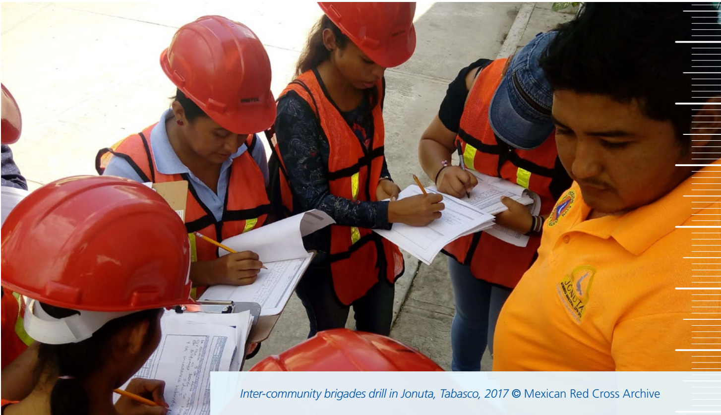
Inter-community brigades drill in Jonuta, Tabasco, 2017

(CENAPRED) in collaboration with the United Nations Development Program (UNDP).