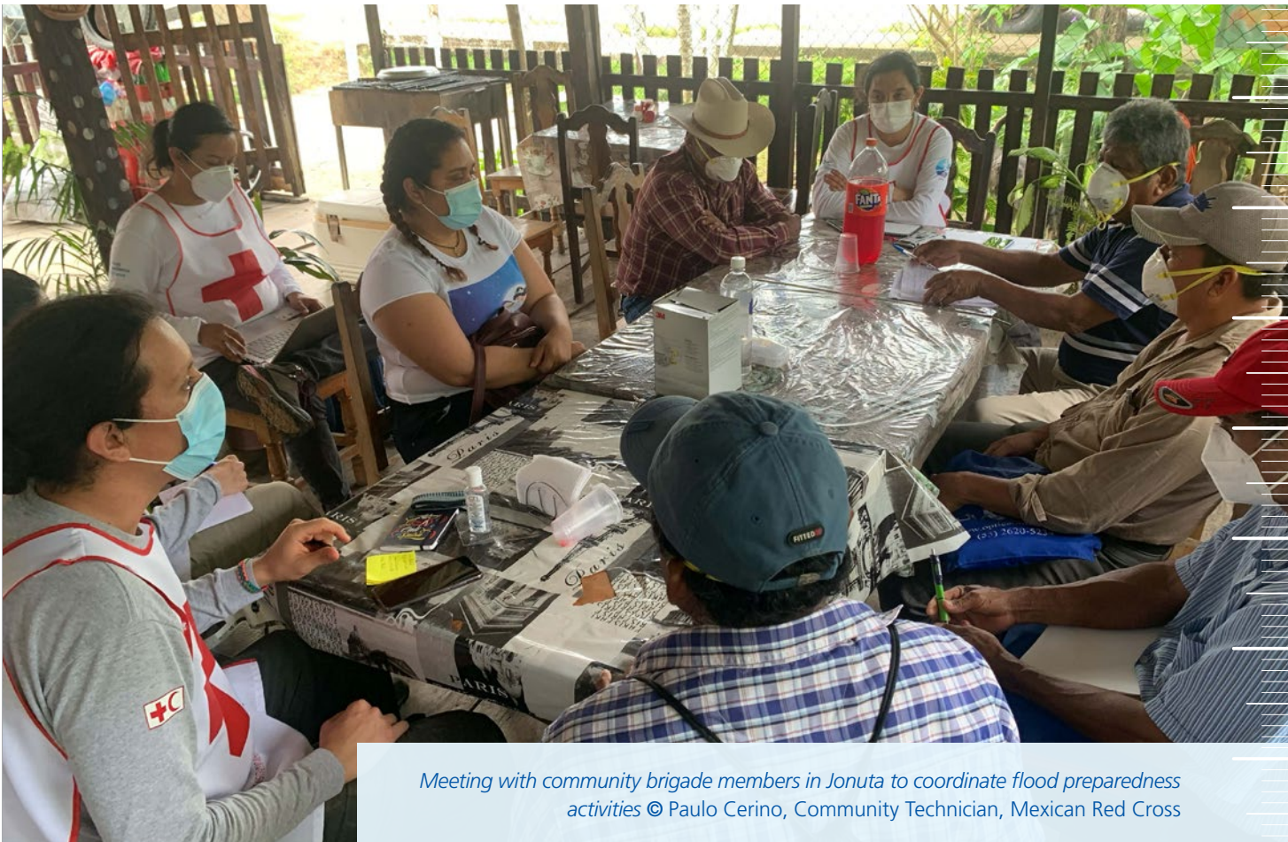
Meeting with community brigade members in Jonuta to coordinate flood preparedness activities

community brigades. It developed a sustainability plan that identified the need for the Institute of Civil Protection of Tabasco to continue collaboration with the community brigades. This led to the Mexican Red Cross signing a formal agreement of collaboration with Civil Protection. In turn, Civil Protection formally recognized the community brigades in 2018. This was groundbreaking: this kind of recognition is new in Mexico, and especially by a governmental institution.