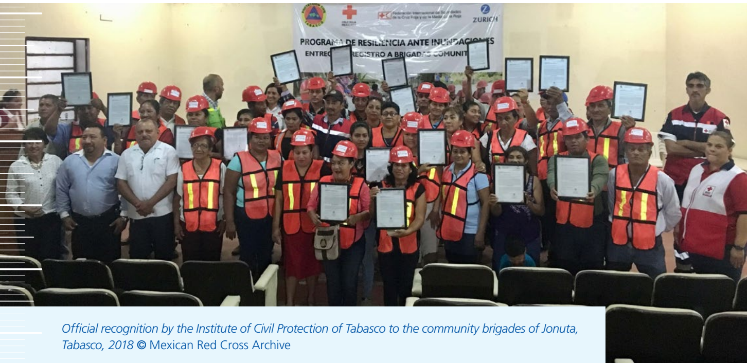
Official recognition by the Institute of Civil Protection of Tabasco to the community brigades of Jonuta, Tabasco, 2018

to high-level meetings on key resilience issues to talk about the brigades, how the brigades help communities, and how the Mexican Red Cross established and trained them. These efforts helped to shape both the National Strategy for Resilient Communities in 2021 and the national registration system for community committees in 2022.