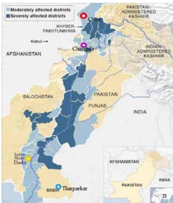
Figure 2 Geographical location of selected districts

to the floods. These were then objectively verified through a quantitative recovery index to ensure validity. The mixed method reduced the sample size and also provided qualitative information on the recovery, hazard, livelihoods and other aspects of communities in various geographic and social settings. It allowed us to test whether or not access to key services prior to the flood contributed to post-flood recovery. It did not, however, allow us to test whether or not the resilience of such systems (e.g. the continued functioning and rapid recovery of the systems themselves) contributed to resilience of the flood-affected populations.